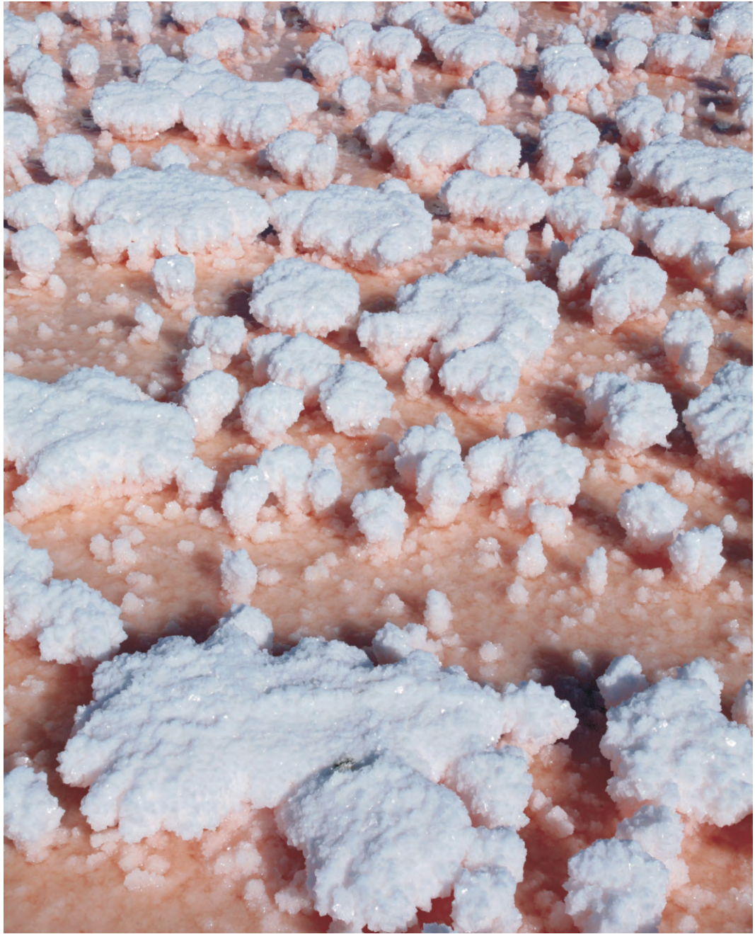
Limited edition 1/3 Pink Landscape, 2011 150 X 120 cms