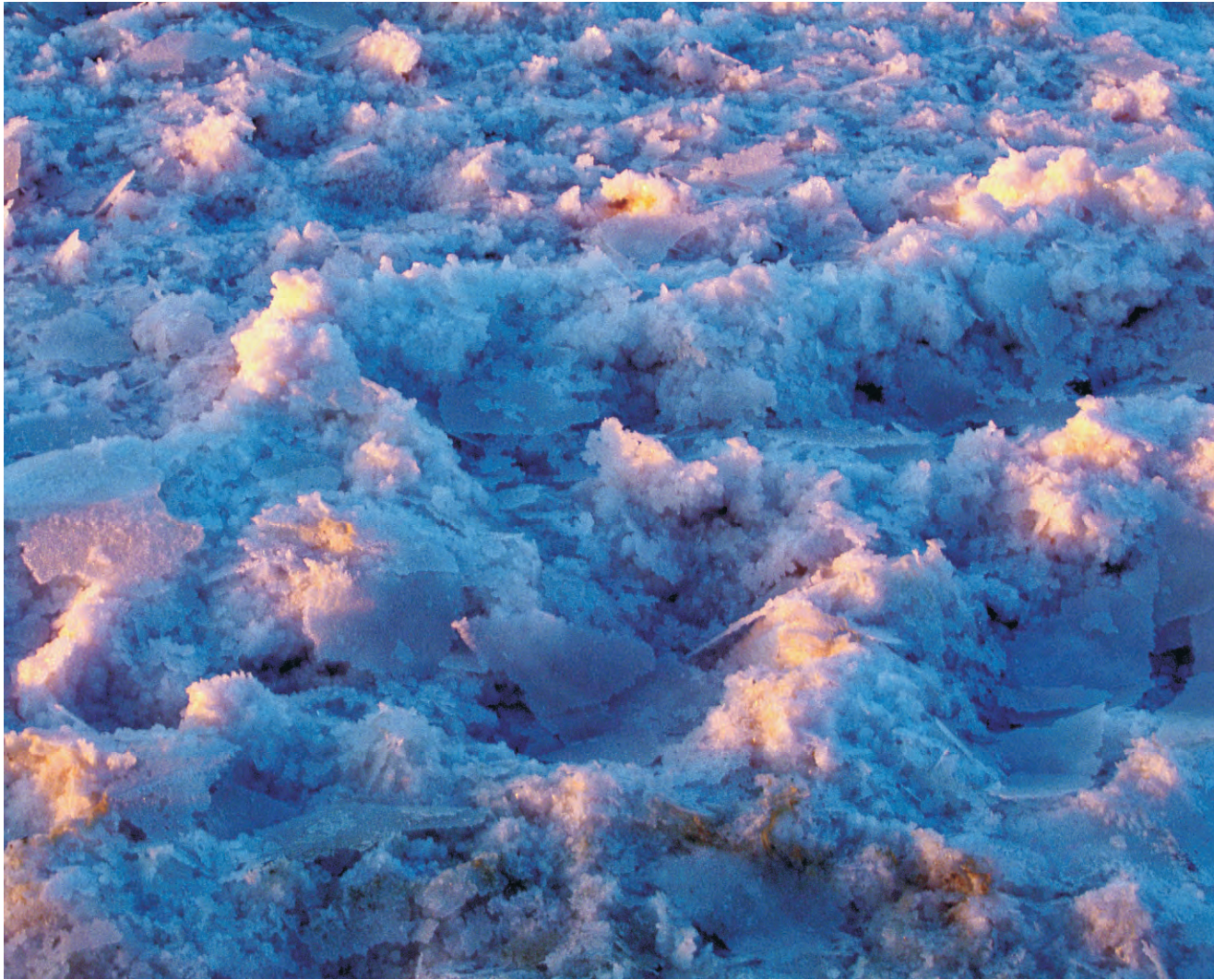
Limited edition 2/3 Harvest 1, 2007 75 x 93 cms